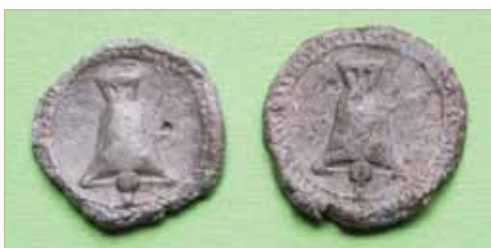
Figs.5a & b. The two bells could possibly have been used as pub tokens, as we have a local called The Bell Inn. The crowns with the initials C.R. may have connections with King Charles who hid in the oak tree after he fled the Battle of Worcester.