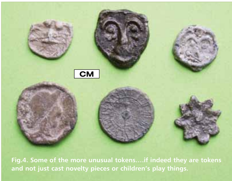
Fig.4. Some of the more unusual tokens....if indeed they are tokens and not just cast novelty pieces or children's play things.