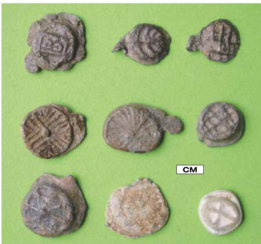
Fig.9. Untrimmed tokens; perhaps this is an indication that they were made locally? As yet I have found no traces of moulds but several pieces of crucible have been picked up in the token fields. It is possible that these may not have anything to do with the casting of tokens, as much bronze waste and slag is also found on these fields.