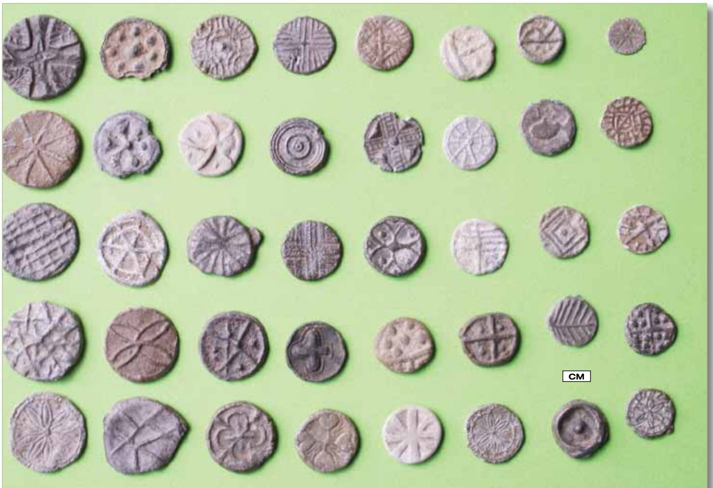
Fig.1. Forty different designs of tokens in various sizes; this is by no means all the patterns found. Some are very crudely made indeed, while others are finely executed.