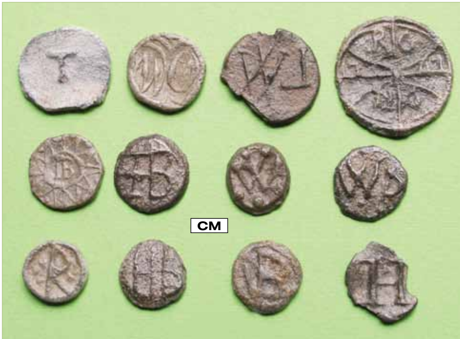
Fig. 3. These are tokens with the initials T, WO, WL, WB, W, IB, HB, B, R, and H. As yet I have been unable to put names to these initials.