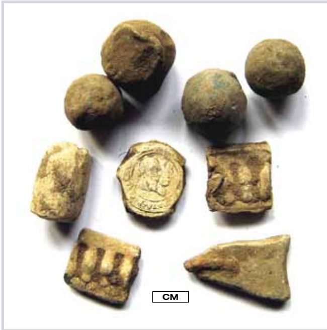
Fig.12. Lead finds including seals and musket balls.