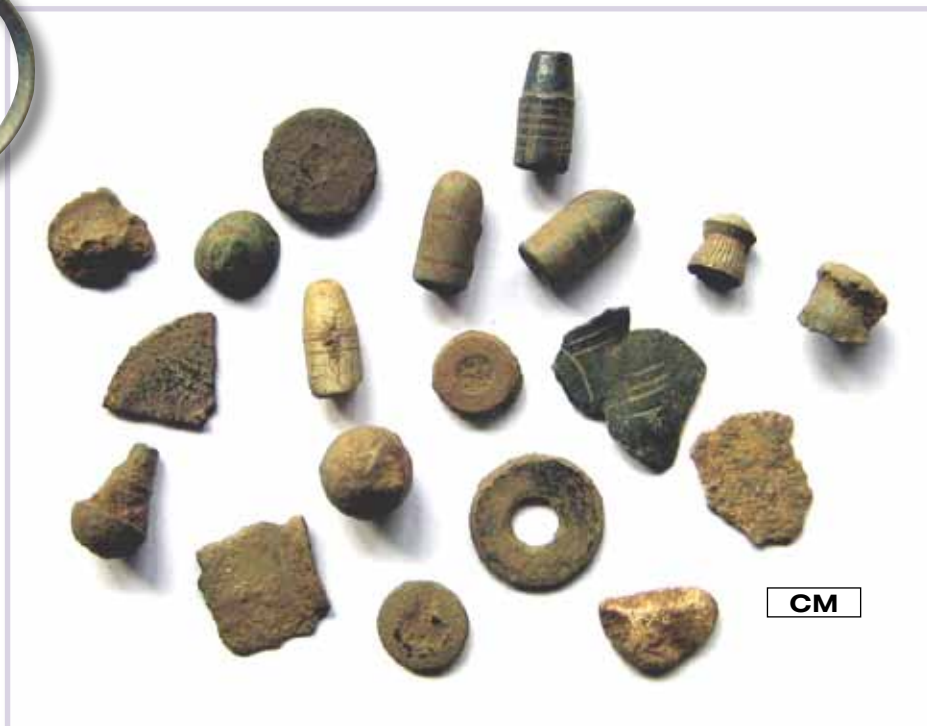
Fig.9. Some of the tiny finds made during the test.