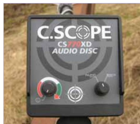
Fig.2. Front panel of control box.