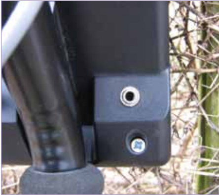
Fig.4. Eighth inch headphones socket.