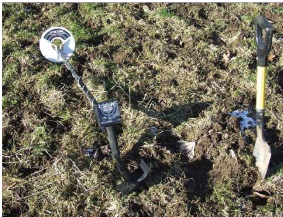
Fig.1. The C.Scope CS770XD