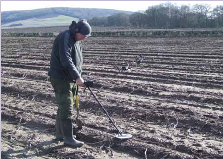
Fig.15. Field testing the C.Scope CS770XD.

Features Include: On/Off Sensitivity switch, Retune touch pad, Inland/Beach selection switch, two tone Audio Discrimination (high for good low for bad), adjustable stem length 1m-1.37m.