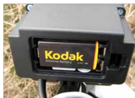
Fig.3. Battery compartment.

T he C.Scope CS770XD is a very lightweight model and offers the user a very simple set of controls. These consist of just two rotary knobs and a touch pad push button.