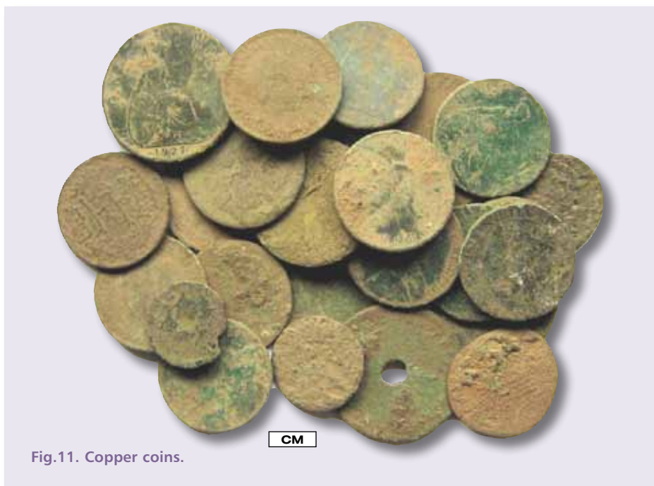
Fig.11. Copper coins.

Type: Non-Motion, Audio Discrimination model with 17kHz + 1kHz Sine Wave operating frequency.