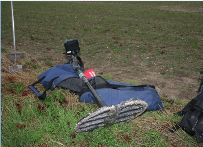
My CTX 3030 fitted with 17 x 13 inch coil.

A few months ago I field tested the CTX 3030 and I would like to share with readers an update of its overall performance. Although I have used Internet data and forums to gather opinions and statistics this “continued appraisal” (for want of a better description) is purely based on my own experiences. However, I must add – and am pleased to say – that the Internet sources referenced do largely back up my own findings.