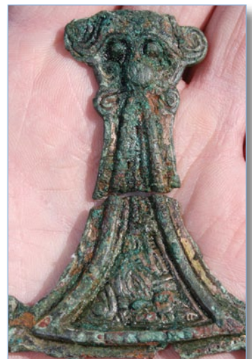
Fig.6. Saxon artefact found in two parts.