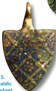
Fig.5. Heraldic pendant.