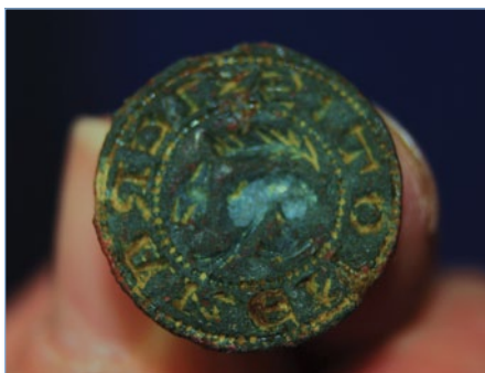
Fig.1. A superb 13th-14th century seal matrix showing a squirrel.

Over the last few months I have been fortunate enough to have made some