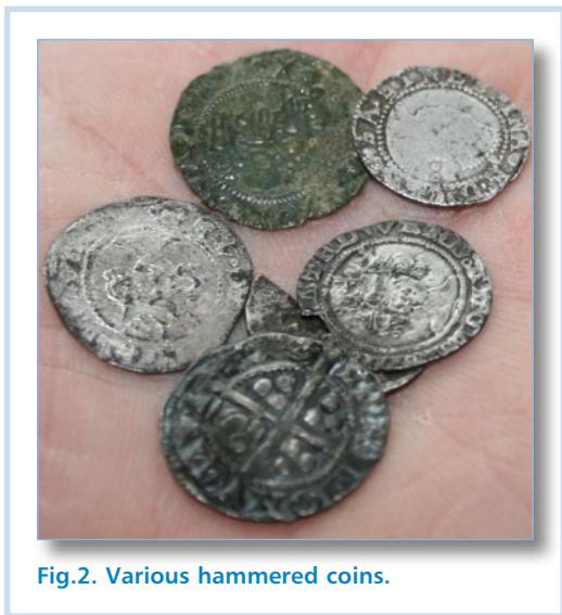
Fig.2. Various hammered coins.

excellent finds with the CTX 3030. These include: a 13th-14th century seal matrix (Fig.1.), several hammered coins (Fig.2.), and hundreds of Roman period coins (Fig.3.), which included a few presentable antoniniani (Fig.4.).