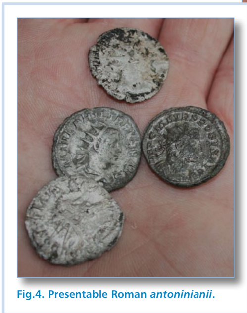
Fig.4. Presentable Roman antoninianii .