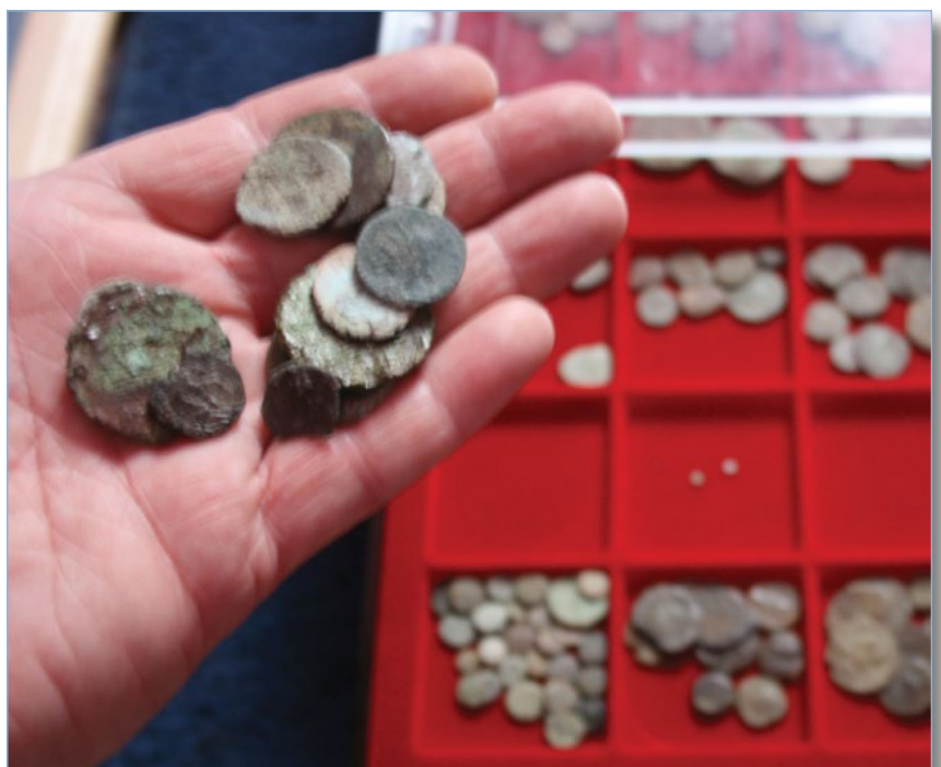
Fig.3. Various Roman coins.

With the CTX I have found that even for a sturdy, aggressive-looking machine the balance is perfect – even when fitted with the high performing 17 inch x 13 inch coil. On occasions, when I am out for very lengthy sessions of say 8-10 hours, I have found that the use of a bungee harness helps my ancient fatigued arms. I personally didn’t find the CTX 3030 “heavy” and I like a machine to have a certain substance anyway, as this aids my sweep and avoids coil drift.