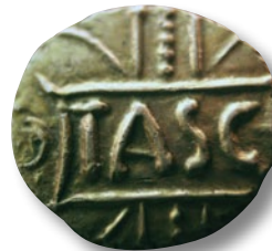
Fig.7. Celtic quarter stater of Tasciovanus.