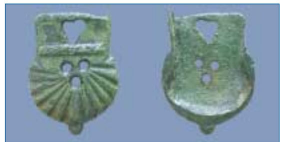
Fig.143 Scabbard Chape, Late 15th - 16th Century

rear one has a large flanged end, which would have been pressed through a lengthwise slit in the belt. The forward one is plain and would have registered in a suitably located piercing. The decorative feature of three lugs around a crescent-shaped end has parallels with certain plate brooches of the 2nd century AD. This similarity, and the use of enamelling, suggests that the buckle plate dates to the same period.