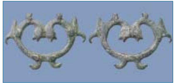
Fig.142 Strap-End, 4th Century AD

have been rectangular in form but, as can be seen from the illustration, only one limb of the loop remains.