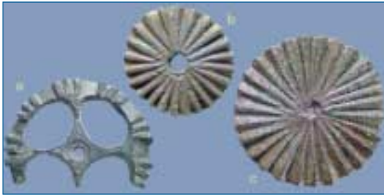
Fig.144 Pastry-Cutter Wheels, 17th - 18th Century Copper alloy (a) 33.5mm dia. (a) 25mm dia. (b) 34mm dia. Found: (a) Cambridgeshire, (b) and (c) Norfolk

Although plastic has largely replaced metal as a material of construction, pastry cutters have changed little in principle over the centuries. These wheels were originally fitted in the forked end of a handle, which often had a secondary tool at its other end for creating patterns on the pastry. Item (a) is possibly the earliest of this group, and has a cutting