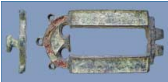
Fig.141 Buckle Plate, Circa 2nd Century AD

Copper alloy 71mm x 35mm Found in Cambridgeshire by Peter Chamberlain