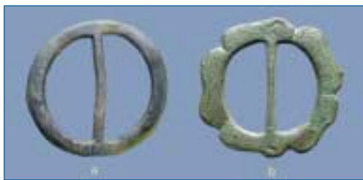
Fig.132 Buckles, Circa 15th - 16th Century

All items are dimensioned in millimetres and their numbering follows on sequentially from the previous Images of Time.