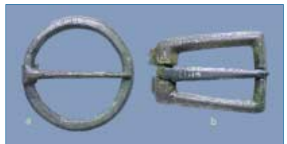
Fig.134 Buckles, 13th - 15th Century

there is a groove, which may be the result of wear. There are also traces of iron rust on one side of the ring. It does not have the usual attachment bar sector of a terret ring, but was very probably used in some harness-related application.