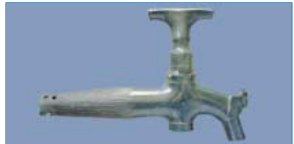
Fig.138 Barrel Tap, 18th - 19th Century Copper alloy 128mm x 83mm Found in Lincolnshire by Tony Russell

missing) purely decorative silver rivets, one passing centrally through the animal's snout.