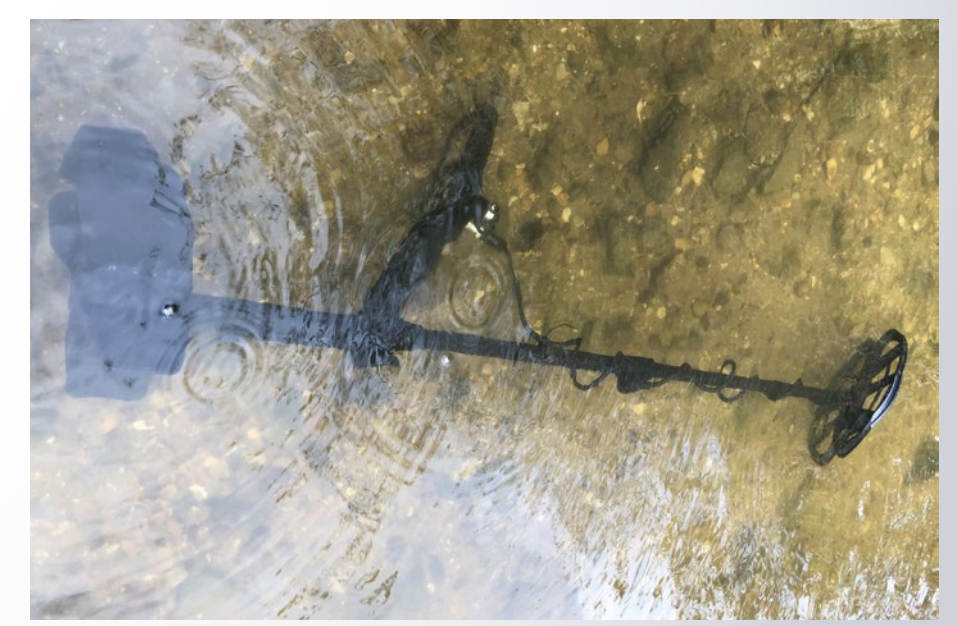
The Simplex+ submerged.

The screen, speaker and coil all seemed to perform just fine and within 10 minutes I had a signal reading 68-71 on an old footpath near the lake. I dug down four inches to find an old 10 pence piece. The machine had no chatter or misting of the screen or crackling from the speaker at all. I carried on for another three hours in the pouring rain