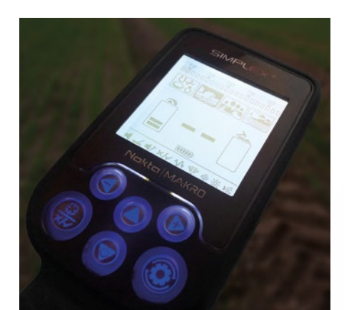
Screen at night with LED spotlight.

I had a strong signal of 55-58 and once again, the piercing tone. Despite