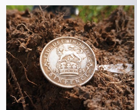
Lovely 1925 sixpence.

those hard of hearing. As for the battery life from the internal USB rechargeable battery, I found this easily lasted me a good couple of sessions before it needed charging. I also used my USB power bank to charge the machine whilst detecting which is another nice feature. I especially like the way you do not need a cover over the main control box in the event of heavy rain, you can be confident it is truly waterproof.