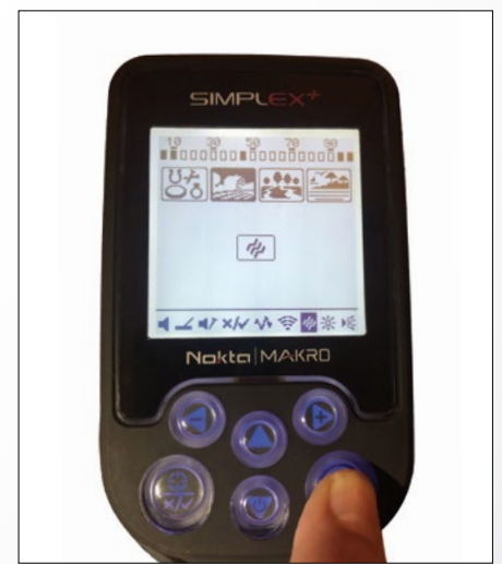
Vibration setting, great for underwater and hard of hearing.

Now this is by no means an indepth review of the Simplex as I have only been able to use it for a certain number of hours so far. But based on the different ground test conditions I have put this machine through, it really did impress me and I'd say it's a winner, especially at this price point. I have even used the features that would not normally be of benefit to me, such as using it at night in my garden with the LED spotlight, which I found highly effective, as well as the ability to choose the vibration mode which is really helpful for