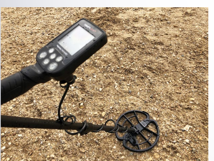
Detecting on the beach I found a crisp 50 pence piece at around 4 inches.

I headed into the wash whilst the tide was coming in having completely forgotten about the hole in my welly! The coil created a little chatter on entering the water, but after a few seconds it settled down and I detected happily along. I had a few iron signals