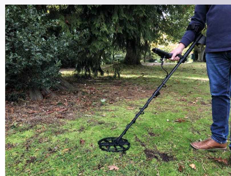
Detecting on estate grounds.

my work clothes, I pinpointed the target and dug down with my spade. Six inches down and smack bang in the centre of my hole was a lovely 1925 sixpence.