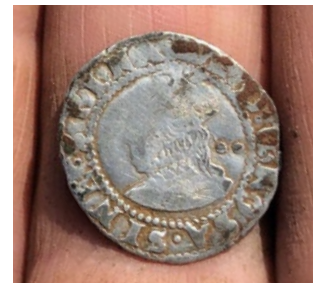
Elizabeth I halfgroat found on the first field trip.

lawn, so I gathered my digging tool and pinpointer and dug down about five inches. I removed the very perfect plug – it was my lawn after all! Intrigued as to what I would find, I turned on my pinpointer on only to hear my wife shouting “You have your work trousers on, you will get them muddy.” Unfortunately, I suffer with selective hearing like many men in the UK over 40, so carried on.