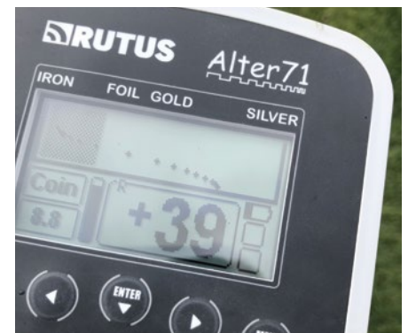
Iron on the hodograph display.

All Metal Motion A mode that allows you to search for deep large items but still allows you to separate close targets better than in all metal.