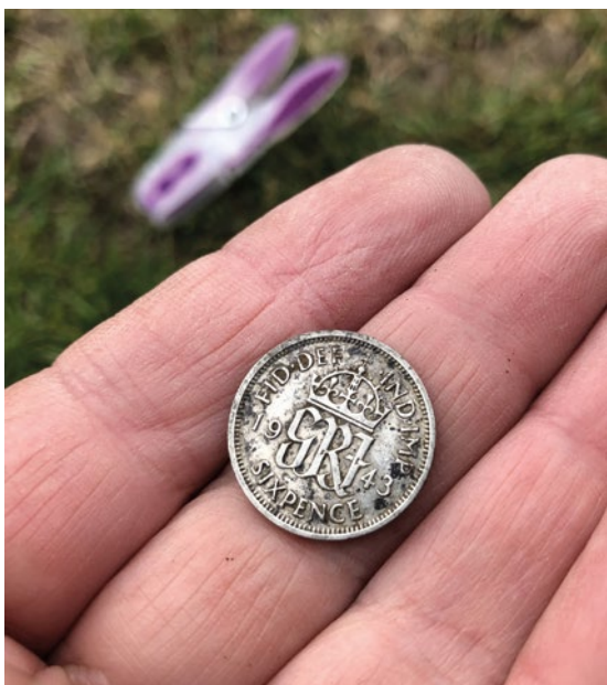
The 1943 dated sixpence located in my garden – my first attempt at using the Rutus Alter 71.