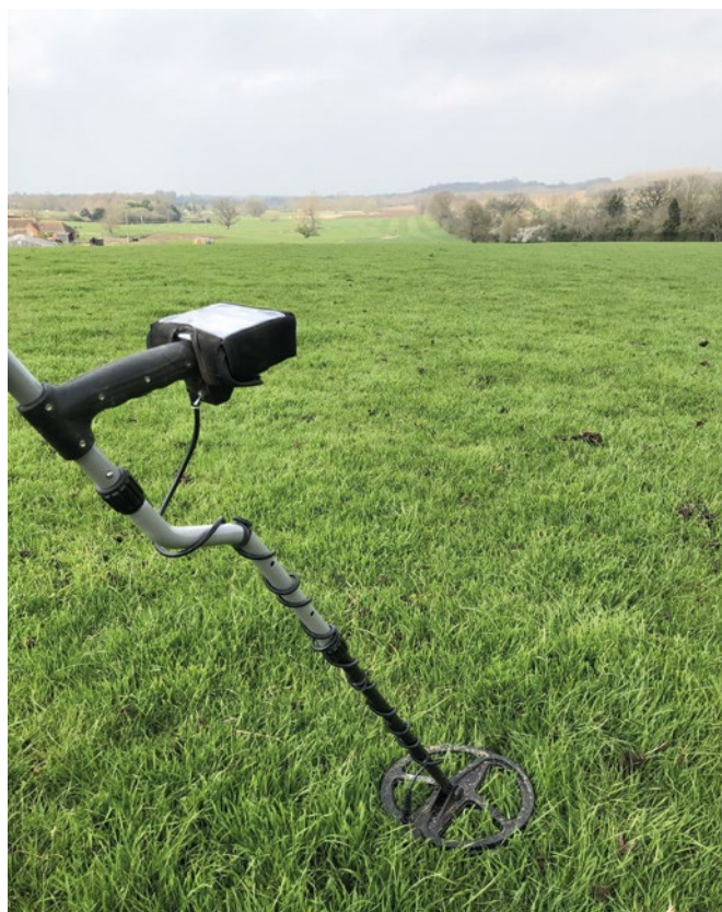
Out in the fields.

Dual Mode This combines the all metal channel with the motion discrimination channel. Once I got used to the machine, I found this mode to be the most informative.