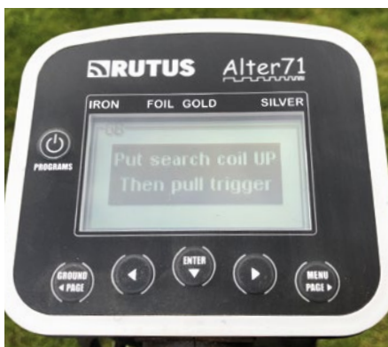
Start-up message for ground balancing.