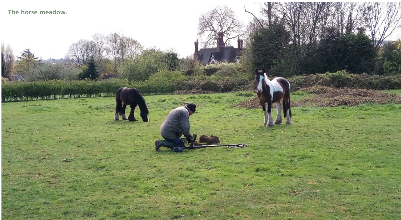
The horse meadow.

mode as the area had lots of heavy iron contamination. After searching for half an hour and struggling with digging through the old tree roots, I had a great signal ranging from 67-78. Digging five inches down, I found what I thought was a bishop's badge of some kind. However, after a quick Google it was identified as being a Sunday school cap badge from the 1940s. I then turned the Alter 71 back to basic mode to see how the machine handled the wooded area. This turned out to be a great setting and anything but basic. I found another sixpence at just four inches down and many more musket balls. The thing that impressed me most was a faint signal flickering between 68-79 and an almost straight line on the hodograph display. "It must be deep," I thought as the VDI was disappearing off and on. Digging