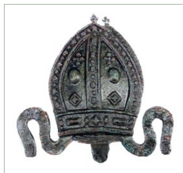
Sunday school cap badge.

On this site I was able to really have a play with all the settings on the Alter 71 and use the two coils that came with the machine: the 11-inch DD