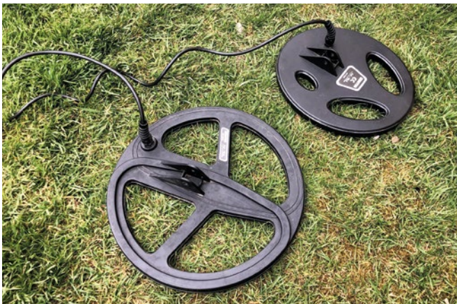
11" DD and 8x9" CC search coils that come with the Rutus.