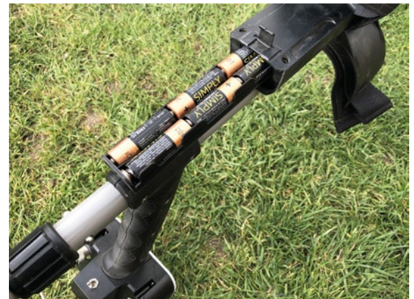
Battery housing for six AA batteries.

touch that someone has really thought about, and really did help in keeping the coil cable secure and neatly finished off the assembly. I would be interested to see how these perform with use, as we all know that Velcro can come loose over time.