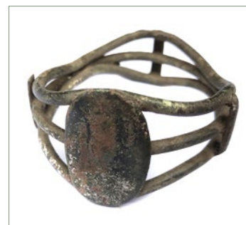
The serviette ring at first thought to be a Roman bracelet.

I found the 8x9inch CC coil was ideal for a small wooded area close to where the horses were kept. Here I switched the Alter 71 to Ultra-Fast