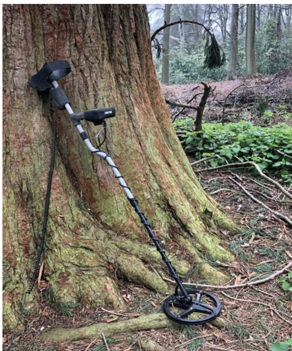
Area of woodland we searched.

already acidic sandy soil site with plenty of ancient animal urine in the ground. I was rather intrigued too see if anything found would be too corroded to be of note.