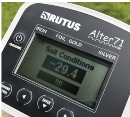
Ground balance warning.