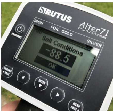
Ground balance OK.